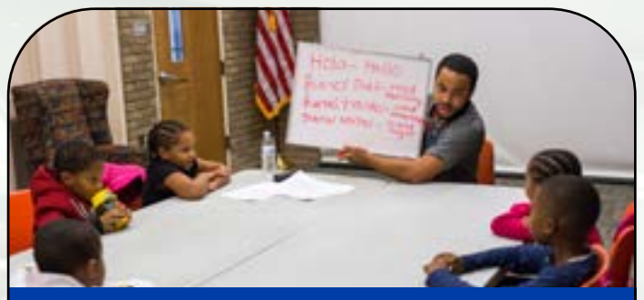
Expanding Access for Spanish Speakers

The Library served as a key partner for local Census 2020 efforts with a year-long outreach campaign that included Census worker recruitment events, relief supplies and Census completion distributions during the pandemic, and a virtual Census Day town hall.