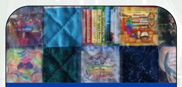
Heritage & Culture

D.C. United and PGCMLS launched a new partnership to support all Prince Georgians with engaging online content during the stay at home order. The partnership, a first-of-its-kind in Major League Soccer, features free access to bilingual English/Spanish workout videos for kids (Talon's Workout Tapes), Ask Me Anything (AMA) events with D.C. United players, and virtual storytime, #SaveWithStories, for children ages 2-8 through the PGCMLS website (pgcmls.info/DCUnited) and social media.